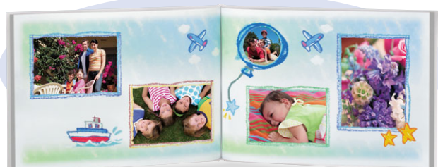
Color Laser Photobook