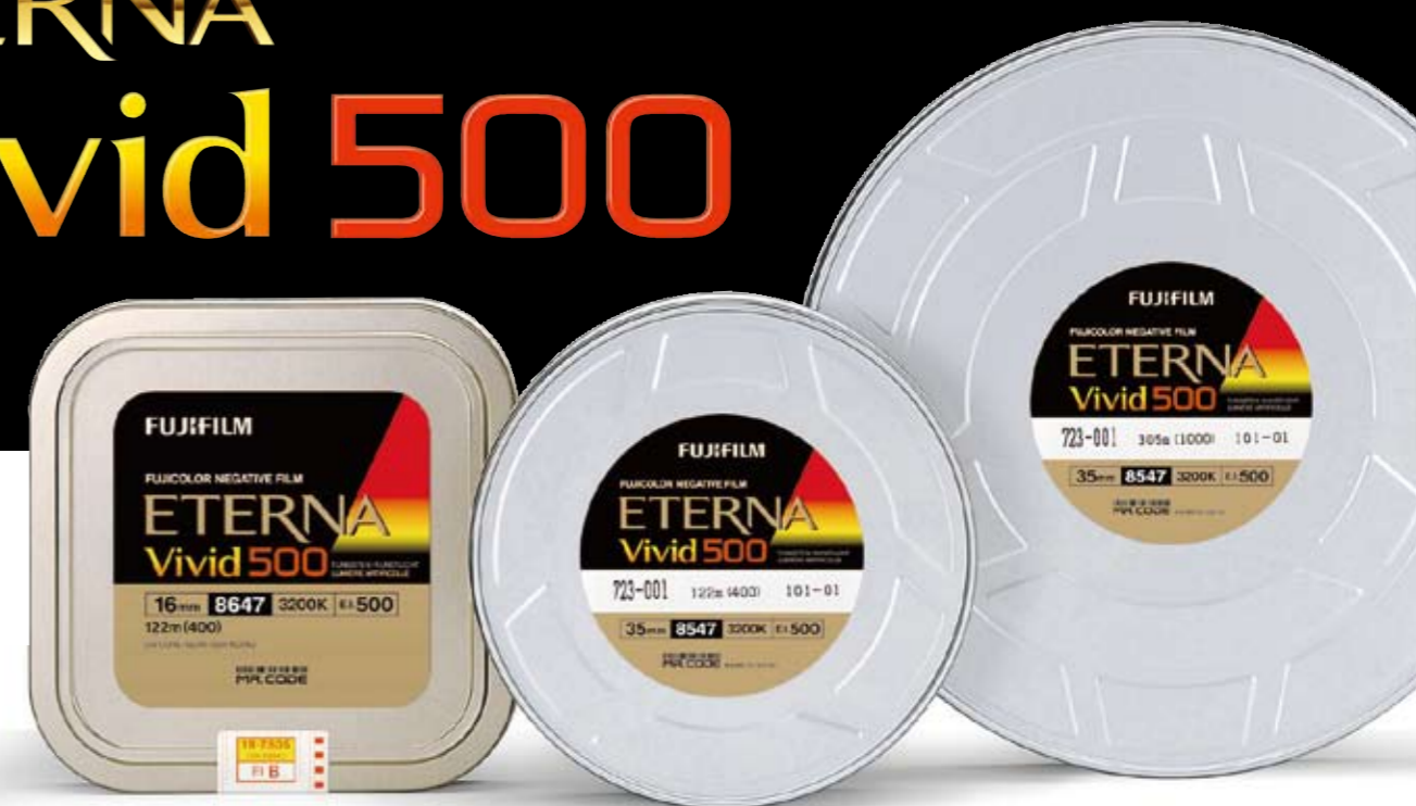
35mm Type 8547 16mm Type 8647