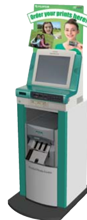
Digital Photo Center with optional floor stand *Optional POP(separate order)

SmartMedia™ is a trademark of Toshiba Corporation. xD-Picture Card™ is a trademark of Fuji Photo Film Co. Ltd., Toshiba Corporation, and Olympus Optical Co., Ltd. CompactFlash™ is a trademark of SanDisk Corporation. SD card™ is a trademark of Toshiba Corporation, Matsushita Electric Industrial Co., Ltd. and SanDisk Corporation. Memory Stick™ is a trademark of Sony Corporation. All other brand names or trademarks are the property of their respective owners.