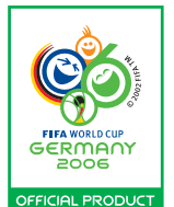
Fujifilm – Official Imaging Sponsor of 2006 FIFA World Cup Germany™