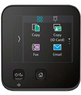
2.8-inch colour touch panel