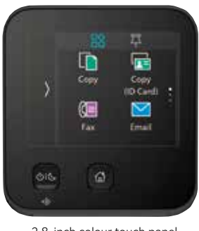
2.8-inch colour touch panel