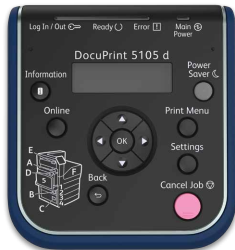
The simplified control panel of the DocuPrint 5105 d makes on-printer operations quick and easy.

The DocuPrint 5105 d incorporates a paper security function that allows the user to Water Mark printed documents with a copy restriction code and a Universally Unique Identifier (UUID), that restricts the document from being copied or scanned, and can also identify the print machine that was used to print the document.