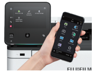
Print from mobile devices