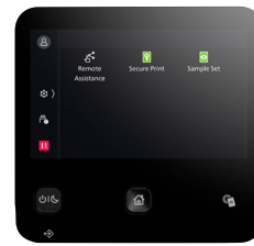
5-inch colour touch panel