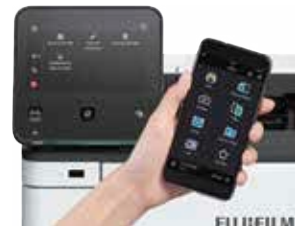
Print from mobile devices