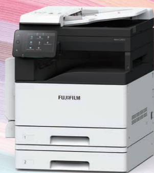
Apeos C2450 S with Optional Tray Module