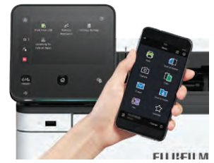
Print from mobile devices