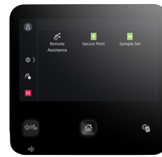
5-inch colour touch panel