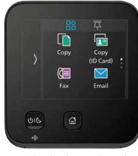
2.8-inch colour touch panel