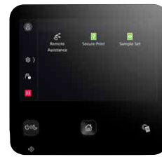
5-inch colour touch panel