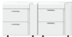
2nd High Capacity Feeder C1-DS+ High Capacity Feeder C3-DS + Multi Sheet Inserter*1

2000 sheets x 2 trays+250 sheets Maximum SRA3, 330 x 488 mm