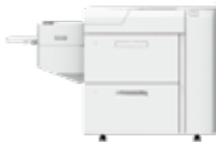
Air Suction Feeder C1-DSXL*2 + Banner Unit for Air Suction Feeder C1-DSXL

2100 sheets x 4 trays +250 sheets Maximum SRA3, 330 x 488 mm