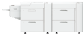
Chained Air Suction Feeder C1-DSXL-L*2 +Chained Air Suction Feeder C1-DS-R + Banner Unit for Air Suction Feeder C1-DSXL

800 sheets + 2100 sheets+250 sheets Maximum 330 x 1200 mm (Upper tray)