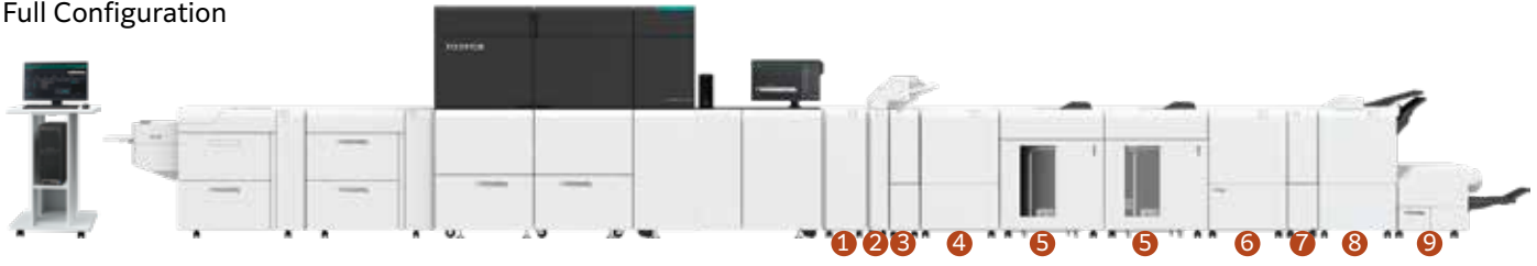
Full Configuration: W 10462 x D 1104 x H 1786 mm