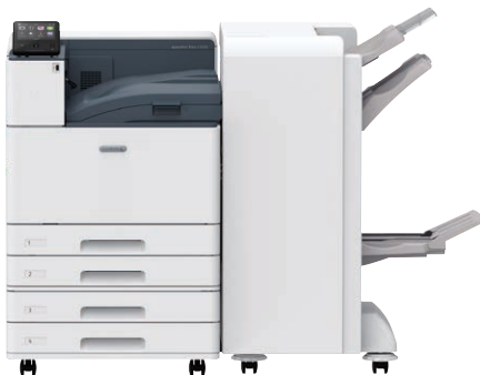
With 2 Tray Module and C3 Finisher with Booklet Maker

Staple capacity of up to 50 / 65 sheets* / Punch* / Saddle Staple / Single Fold