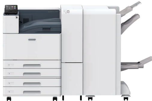
With 2 Tray Module and C3 Finisher with Booklet Maker and Folder Unit CD1

Staple capacity of up to 50 / 65 sheets* / Punch* / Saddle Staple / Single Fold