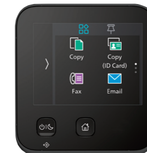
2.8-inch colour touch panel