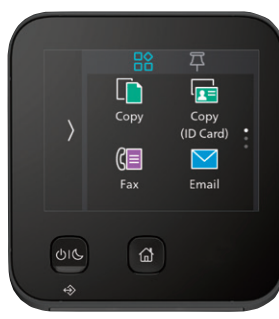
2.8-inch colour touch panel